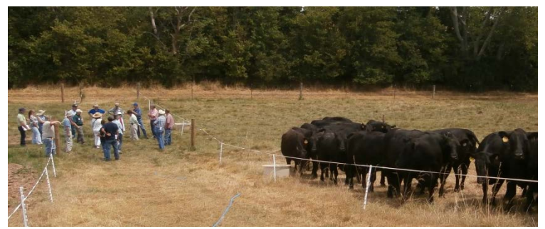
A group discusses ultra-high density grazing while walking through demonstration plots showing traditional grazing versus ultra-high density grazing.