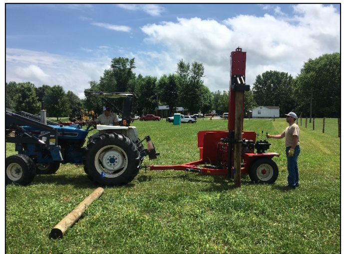
Brace building and post driving demonstrations were held at the 2019 Kentucky Fencing Schools.